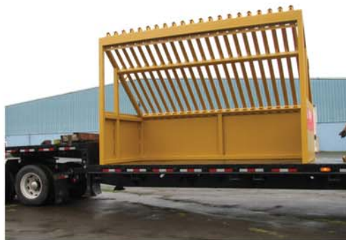
14' Loading area