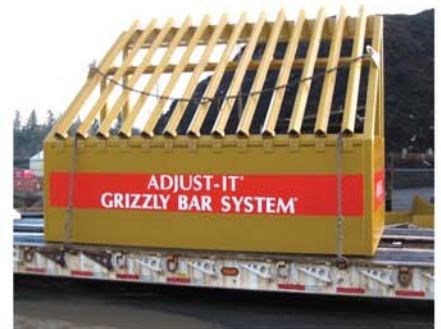
Heavy duty with 4"x 4" x 1/2" Grizzly Bars