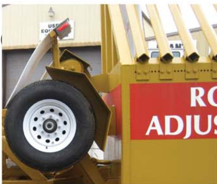
Portable for easy transportation